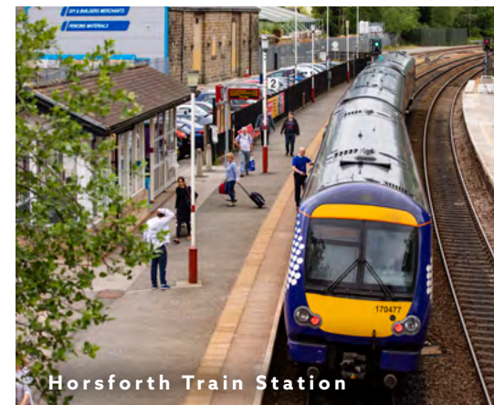
Horsforth Train Station